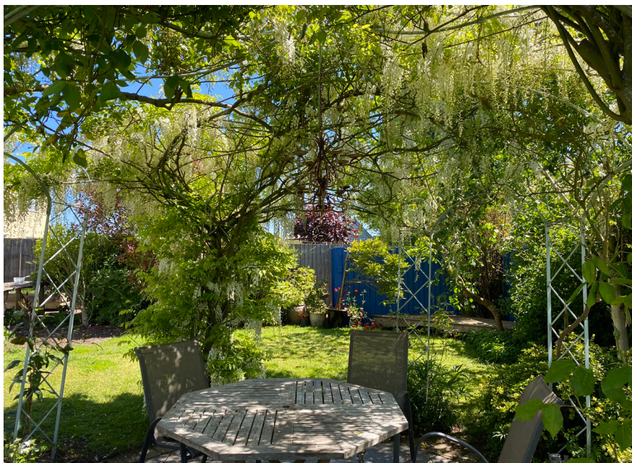
CLEMATIS MACROPETELA JAPANESE WISTERIA FLORIBUNDA ALBA with long white racemes WHITE ROSE MME ALFRED CARRIÈRE

Blush white roses take over through the summer months until the first frosts. I had overplanted and so the elegance turns to a punk look but is beautiful from bedroom windows.